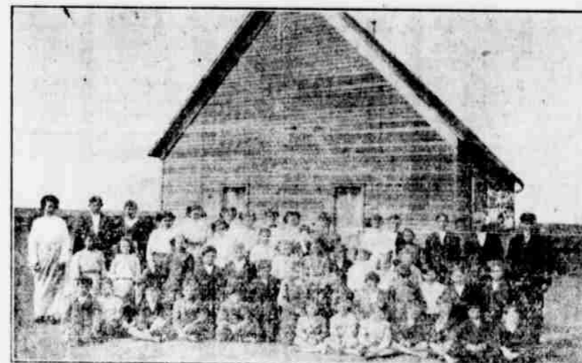
DENNIS SCHOOL HOUSE