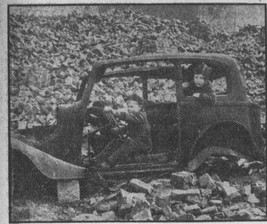
PLAYTIME AMID SCARS OF WAR-Four years after the war's end, many sections of Berlin are still clogged with the rubble of bombed buildings and wrecked army equipment. These grim mementos, however, have a lighter side-they serve as playgrounds for German children, offering no end of adventure. These youngsters are playing in the wreckage of a former German Army staff car amid the ruins of a street in the U.S. sector.