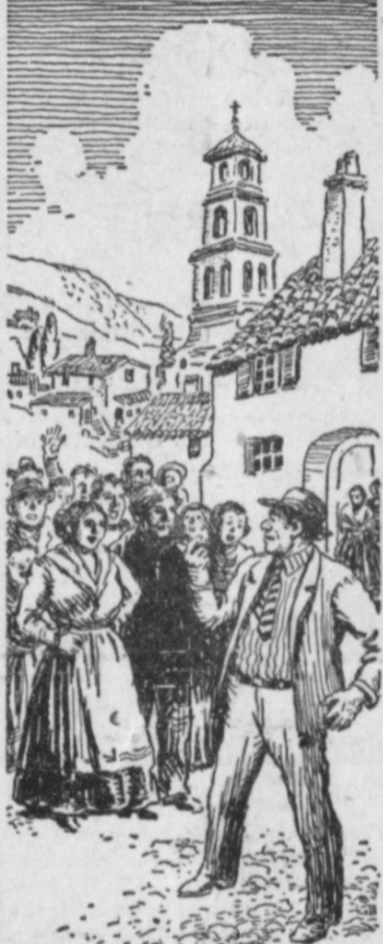
The Major will be very angry if you do not stop right here.

and went to the crowd. "Do you want fish?" he asked the crowd. "Yes!" the people shouted.