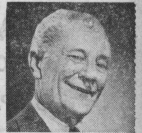
"Believe you me, I'm taking his advice. Knowing what I know now, I'm taking no chances on the lubrication my car gets. I aim to keep it in service—and definitely!"