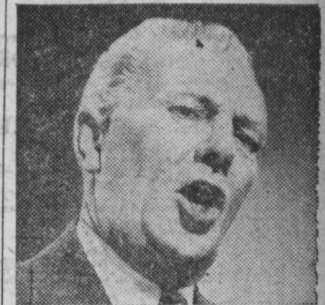
"Oh, well"—I kept saying—"come Victory, I'll buy a new car in a hurry."