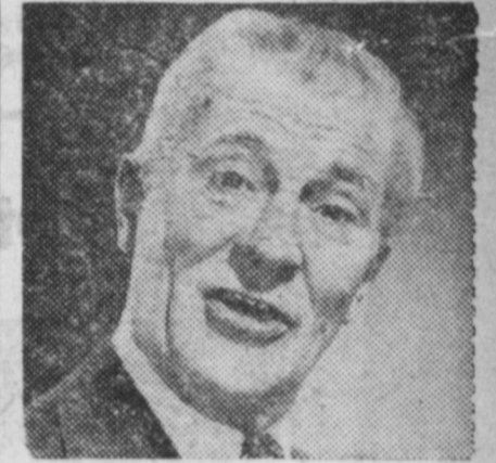
"So I'm plenty thankful to my Gulf man. He said just stick with Gulfpride* and Gulflex**. They'll help keep me on wheels till 'new-car day!'"