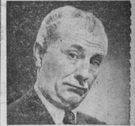
"Was I kidding myself! I've just heard it may be two years or more after Victory before I can get one!"