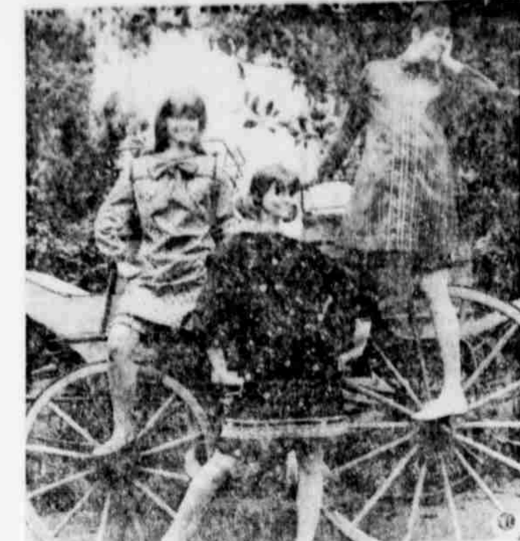
BLOOMER GALS '67—The "mini" continues in favor for fall, but something new has been added. It's the pantaloons, peeking out from under the short hemlines in matching fabrics. Three versions of the new look, all in varied cotton satin prints, feature contrast trimmings ranging from dainty laces to a jaunty bow. All by Charm of Hollywood.

The two-day conference, sponsored by the Texas Firemen's Training School of Texas A&M College, reviewed fire prevention and investigation techniques.