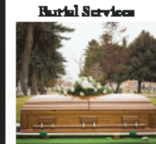
We can attange for burial in any camctary. Services may be gravedde, in our chapel, your church, ar ather location of your choicz.