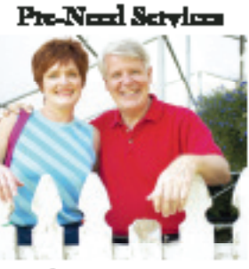
Pre-planning protects your family both financially and emotionally. Plana can be pre-paid to protect against inflation and price-increase.