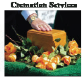
We provide any type of cremetice active. Let us seeist you in the Cremation Service of your chalas.