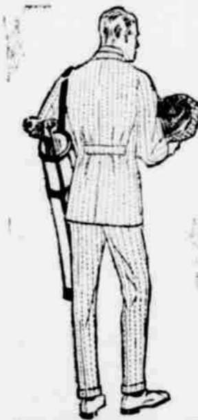
Designed by Rosenwald & Weil Chicago

Buy them cheaper? Certainly. Comparison is the best way to tell where to spend your money. You