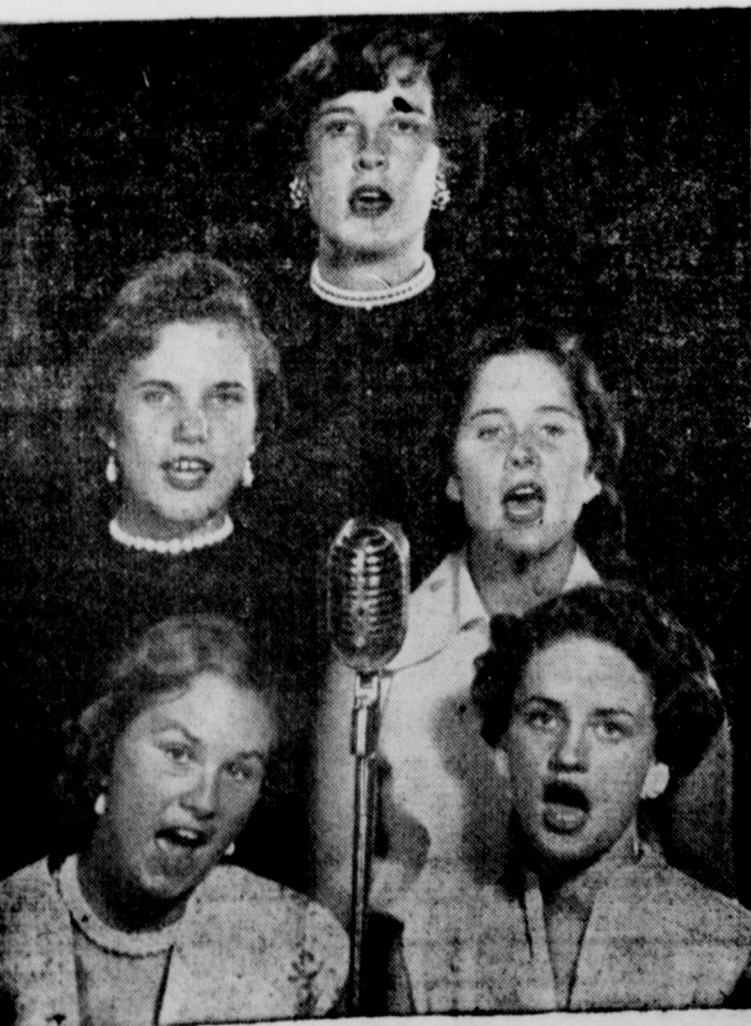
The Methodist Home at Waco is currently on the air every Sunday morning at 8:15. They may be heard on Radio Station WFAA.