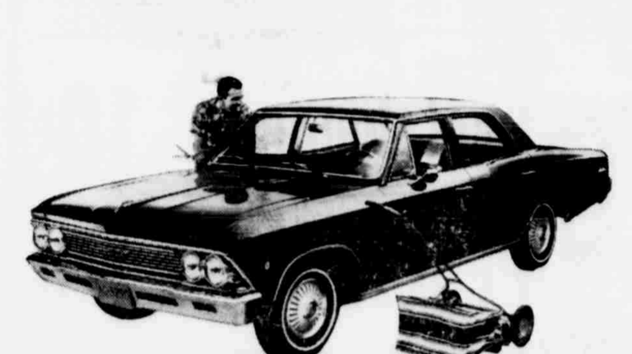
Your Chevelle Malibu 4-Door Sedan will come with eight safety features now standard, like seat belts, front and rear. Always buckle up.

Your Chevrolet dealer is mowing prices right now!