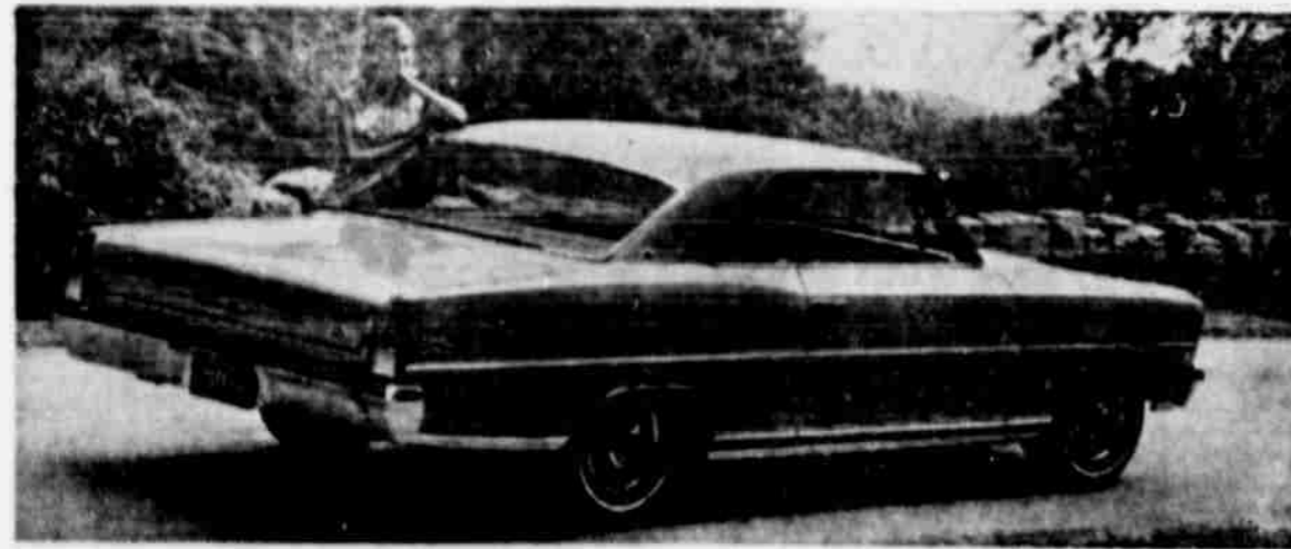
1966 Chevy II Super Sport Coupe

FREE COFFEE, DONUTS AND COOKIES! Also... Free Favors for Our Guests on Both Days.