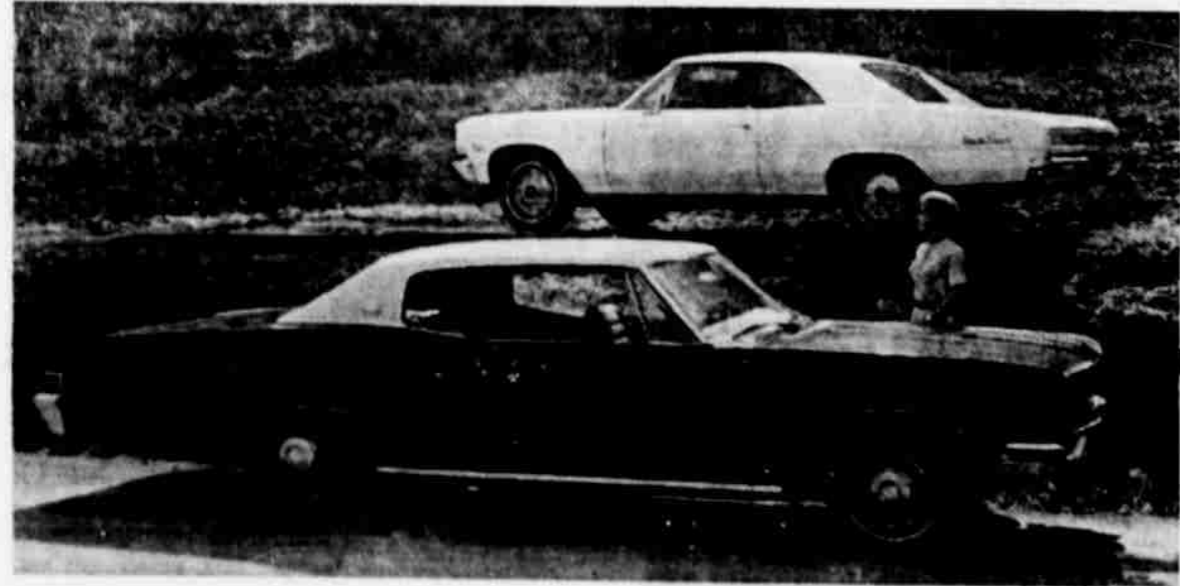
1966 Caprice and Chevelle Coupes

FREE COFFEE, DONUTS AND COOKIES! Also... Free Favors for Our Guests on Both Days.