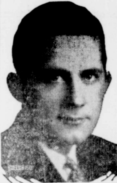
ALLAN SHIVERS of Jefferson County

Senator Allan Shivers will of- ficially open his campaign for lieutenant governor in Port Ar- thur, Thursday, June 27. Dea- of the Texas Senate and World War II overseas veteran, his speech, which will be broadcast over the Texas Quality Network, 8 to 8:30 P. M., will be of inter- est to every voter in Texas.