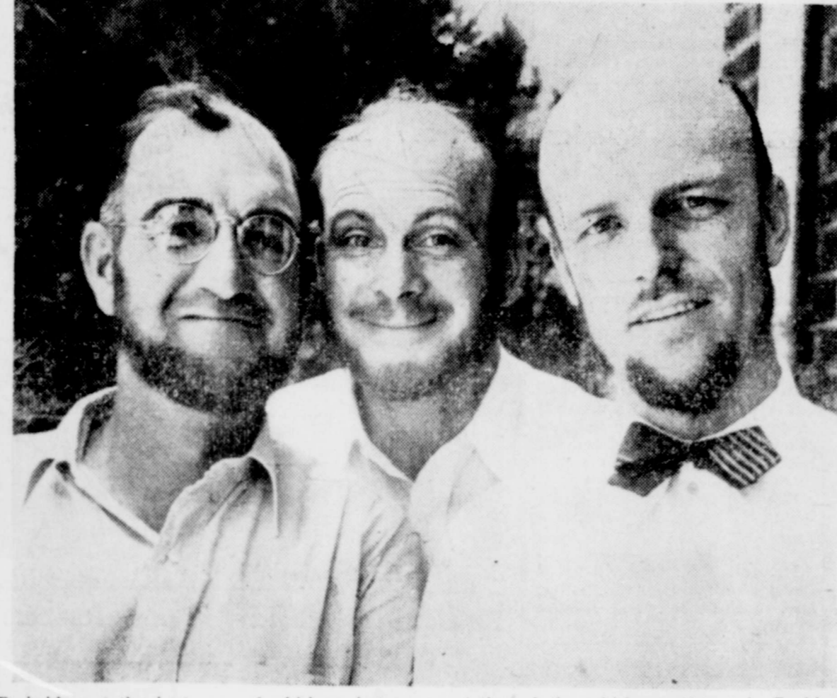
Probably not the best crop of whiskers, but representative of the whiskers attempt in Burk Burnett, the above three posed for a Record News reporter Tuesday to advertise the Boom Town Celebration.