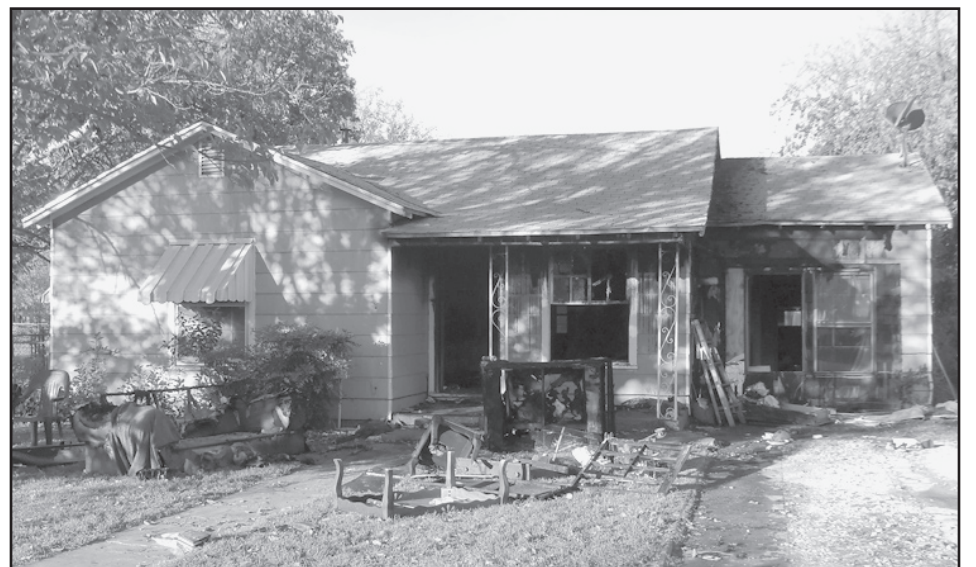
HOUSE FIRE-Early Nov. 21 the Haskell Fire Dept. was paged to a house fire at 1103 N. Ave. K. The home suffered substantial damage, particularly from smoke. The cause is still under investigation.

FOR NEWS ITEMS OR TO SUBSCRIBE, CALL 940-864-2686