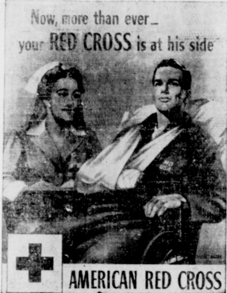
As wounded American boys come back from the battle fronts they find American Red Cross workers in all military and naval hospitals ready to help them. This year there will be more need than ever before for Red Cross service in domestic hospitals. Now, more than ever, your Red Cross is at his side.

The Keys to The Success of This Drive Are In YOUR Pocket