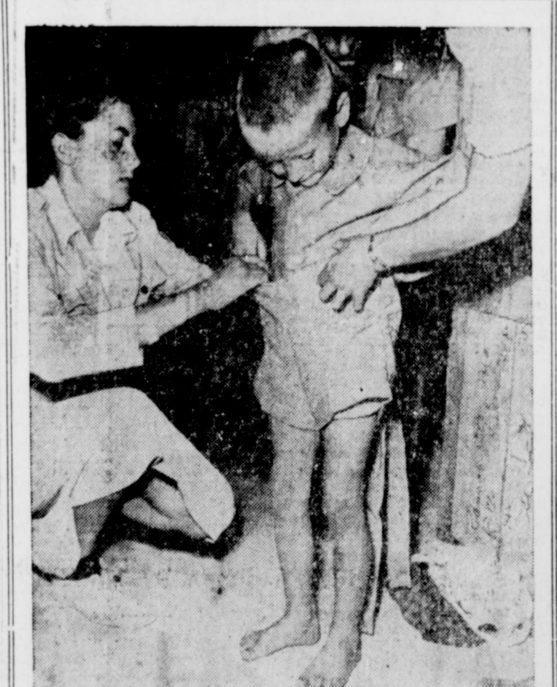
KANSAS CITY TO THE MIDDLE EAST by way of the American Red Cross. These pants and the shirt came from Red Cross volunteer sewing rooms in Kansas City, and are being fitted on a pleased little Yugoslav refugee by a Red Cross civilian relief worker.