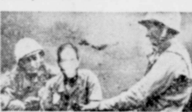
With face deleted according to censorship rules, Jap prisoner receives smoke from U. S. marines on Iwo Jima.

Having overrun the southern half of Iwo Jima, battle-hardened marines pressed the remnants of 20,000