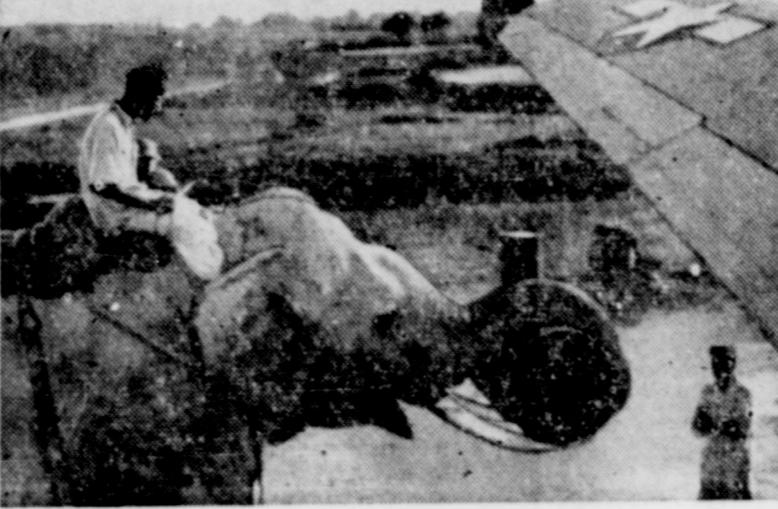
Able to perform the work of 12 coolies, this elephant loads gas drums on American transport command plane flying supplies to troops in Burma.

EDITOR'S NOTE: When opinions are expressed in these columns, they are those of Western Newspaper Union's news analysts and not necessarily of this newspaper.