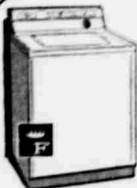
Frigidaire two-speed Jet Action Washer. Has small load setting which helps you save water. Free deep cleaning. Free dependency.