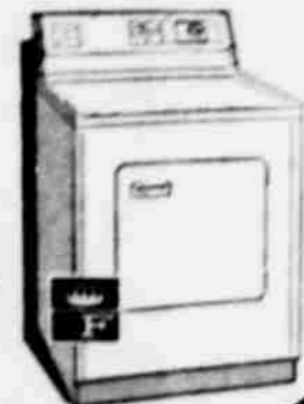
Frigidaire Dryer with Durable Press Care settings in timer. No-iron clothes come out sharp. Clothes in Wrinkle out. And without ironing!