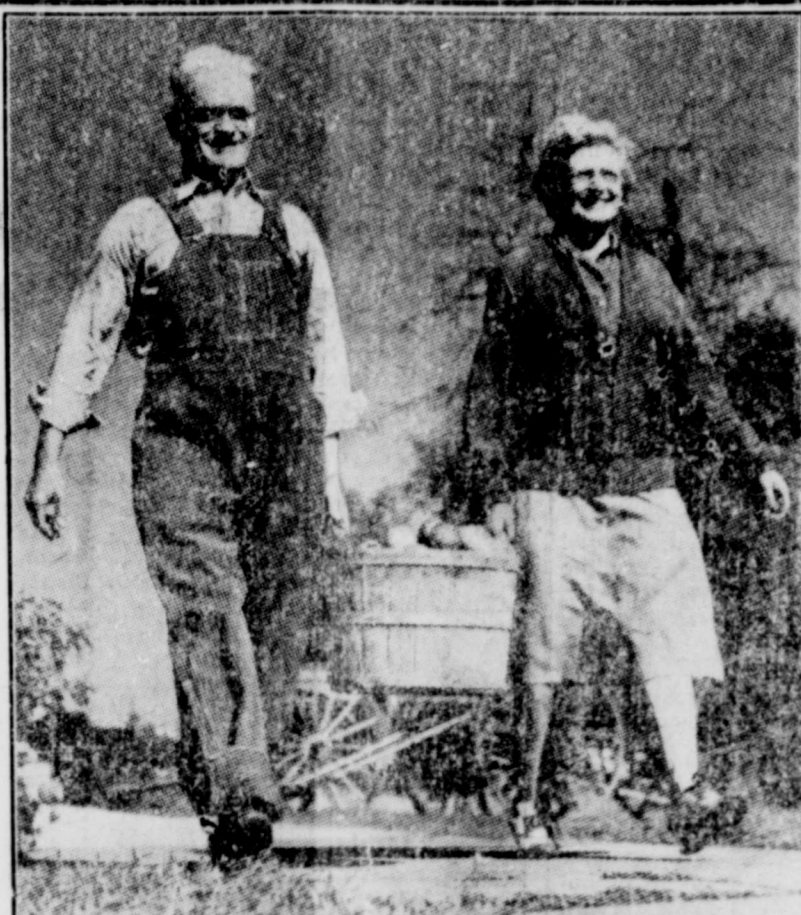
Pictures from home mean a lot to men and women in Service. Send them at least one a week, starting now.

A FRIEND of mine has just made what I consider to be one of the most practical suggestions of the season. He said, "Just think what it would mean to the men and women in Service, if the folks back home made just one picture a week to send to them at camp."