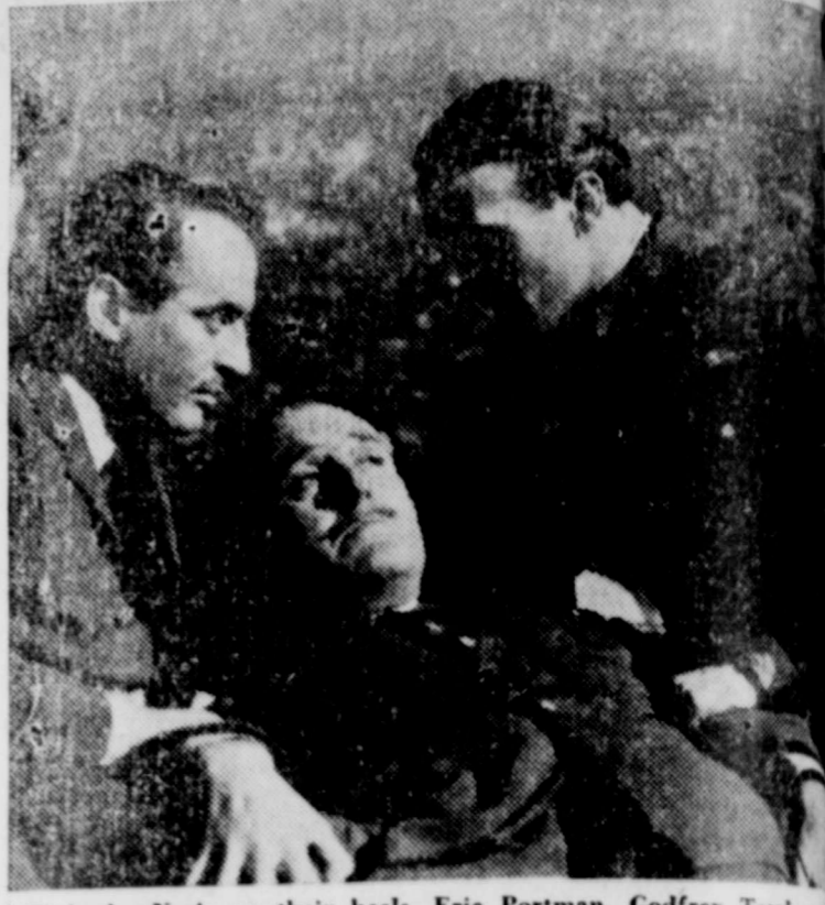
With the Nazis on their heels, Eric Portman, Godfrey Tearle and Hugh Burden halt their perilous flight to the coast in this tense scene from "One of Our Aircraft Is Missing."