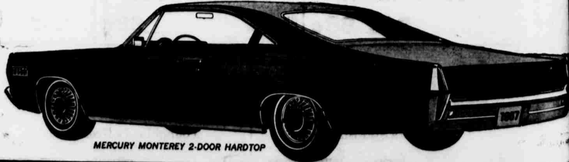
MERCURY MONTEREY 2-DOOR HARDTOP

SPECIAL PRICES ON THIS FULLY-EQUIPPED MERCURY