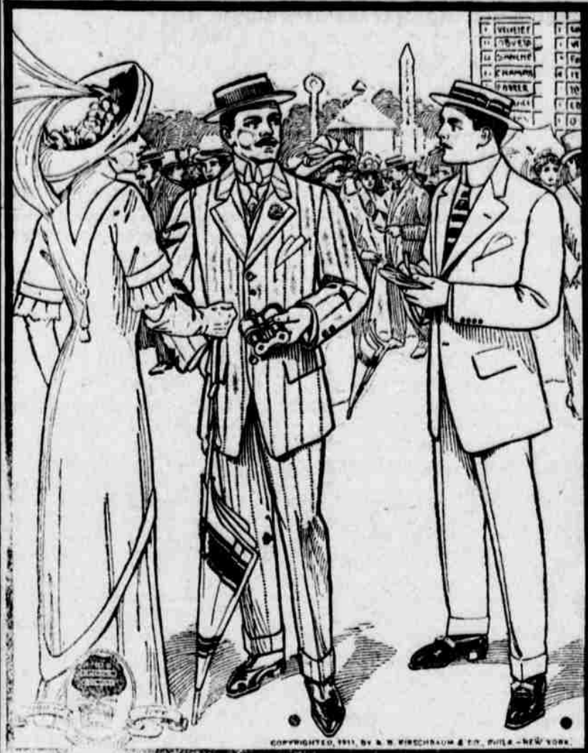
From the reproduction in oil of the racing grounds at Longchamp, near Paris. The Kirschbaum Spring and Summer models shown on the male figures in the foreground (reading from left to right) are the Earl and Dixie.

OT all well-dressed men are gentlemen. But most gentlemen are well dressed.