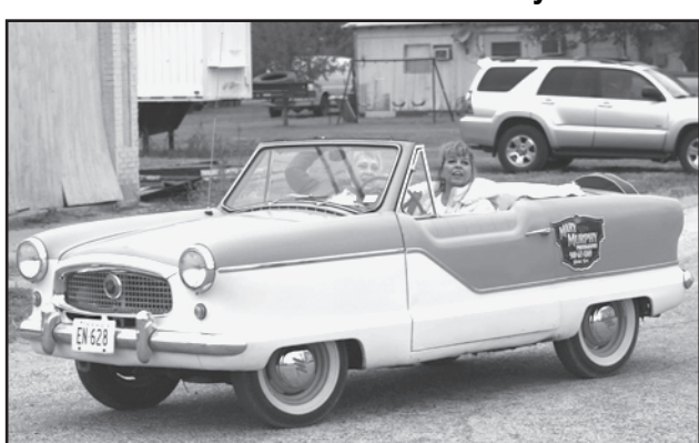
WEINERT HOMECOMING Winner of Automobiles: Turquoise and White 1960 Metropolitan Convertible