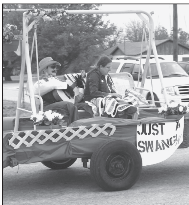
WEINERT HOMECOMING Judges' Choice and Organization Winner Just a Swangin' entered by the City of Weinert