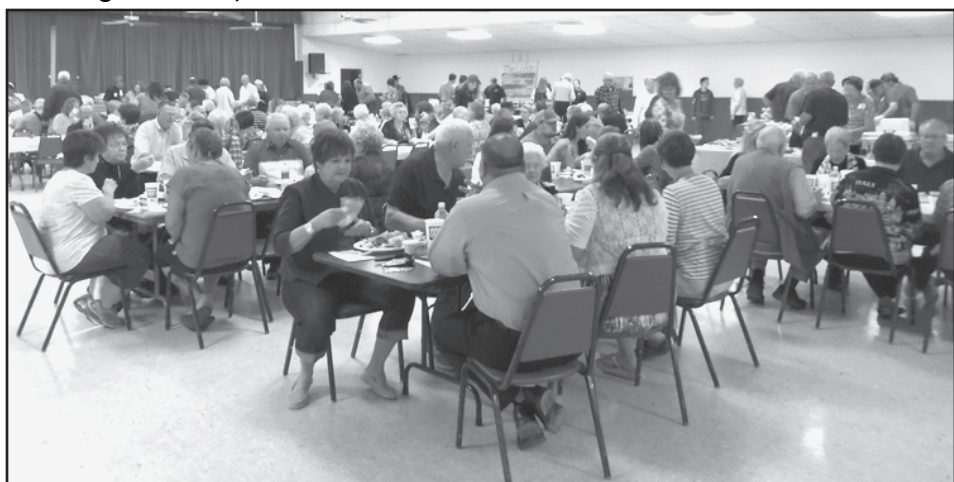
READY TO TASTE —Approximately 300 attended the Taste of Country event held at the Haskell Civic Center last Tuesday.