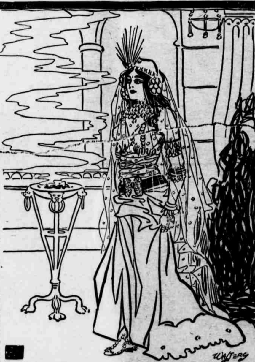
The Scarlet Lips Curled and the Eyes Grew Cold and Hard.

Never send the above letter to a new one and appear from them to say, "They are not genuine, from the fact of having"