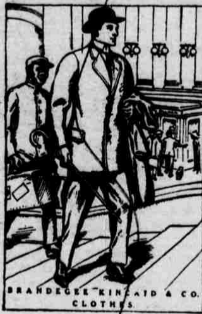
BRUNDAGE, KINCAID & CO. CLOTHES.