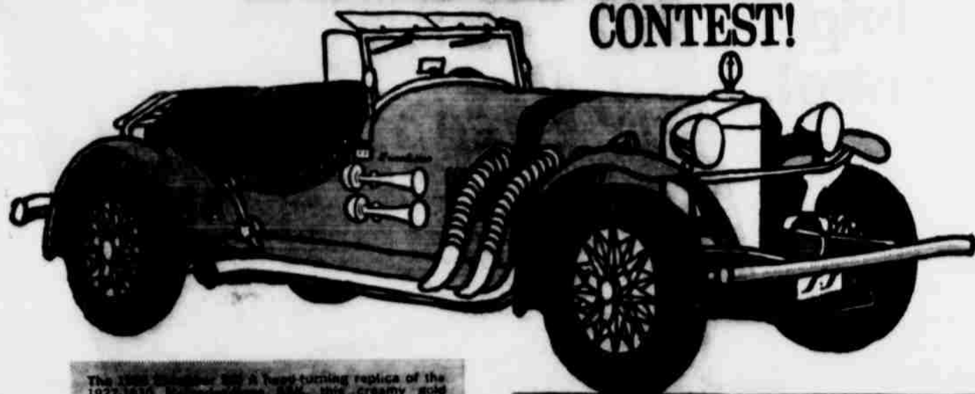
The 1966 Mustang is a high-tuning replica of the 1927-1930 Buick... Excelsior SS is equipped with a 200 HP Corvette engine... Approximate retail value is $25,000. (Designed by Brooks Stevens and manufactured by GM Automobiles, Inc., Detroit, Michigan.)

Once again — for fun! Good times begin with Dr Pepper — fun contests, too! And our prize list this year reads like everybody's "most wanted" list. For you can win a truly unusual automobile — a genuine raccoon coat — and a healthy allowance for a year!