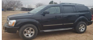
2004 Dodge Durango