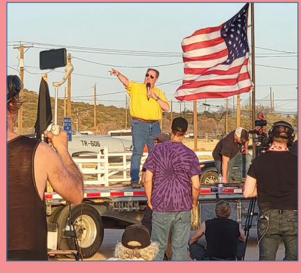
The People's Convoy - a protest movement against strict COVID-19 restrictions, held a rally and camped at the Airpark on their way through Howard County Tuesday evening.