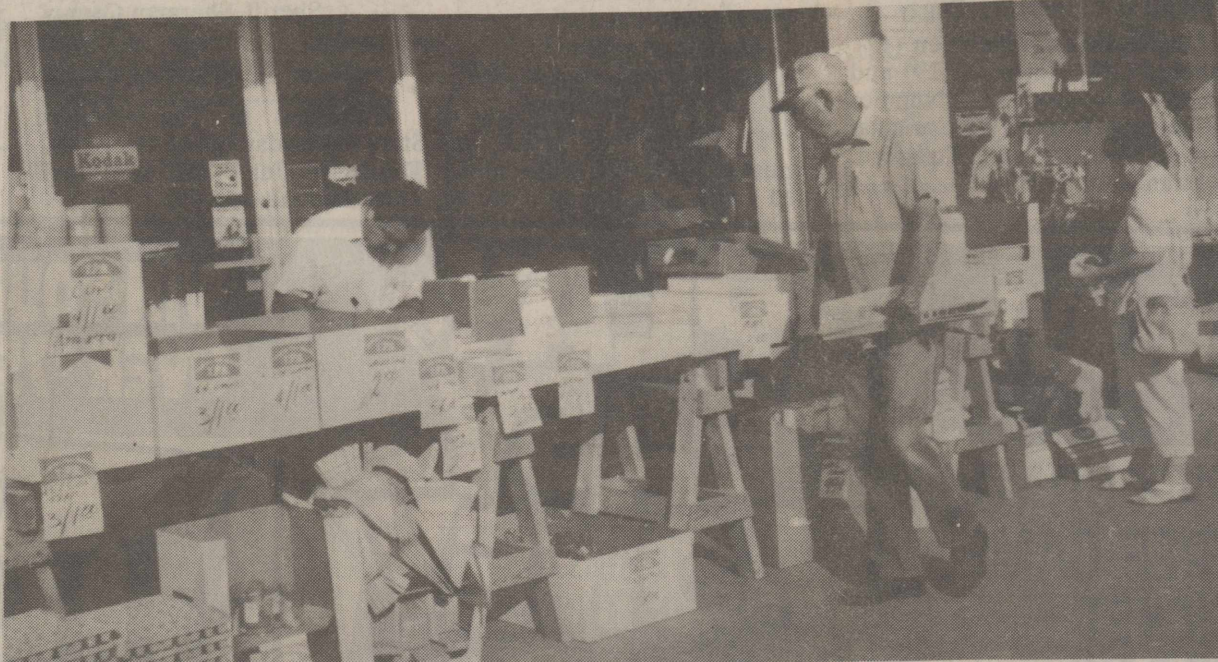
It was a beautiful day for the Stratford Sidewalk Sale. A good crowd turned out and everyone enjoyed the day.