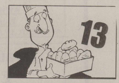
A baker's dozen refers to 13 items, not 12. The term may have originated from a custom among bakers to add an extra piece of bread in case a dozen did not meet the required weight.