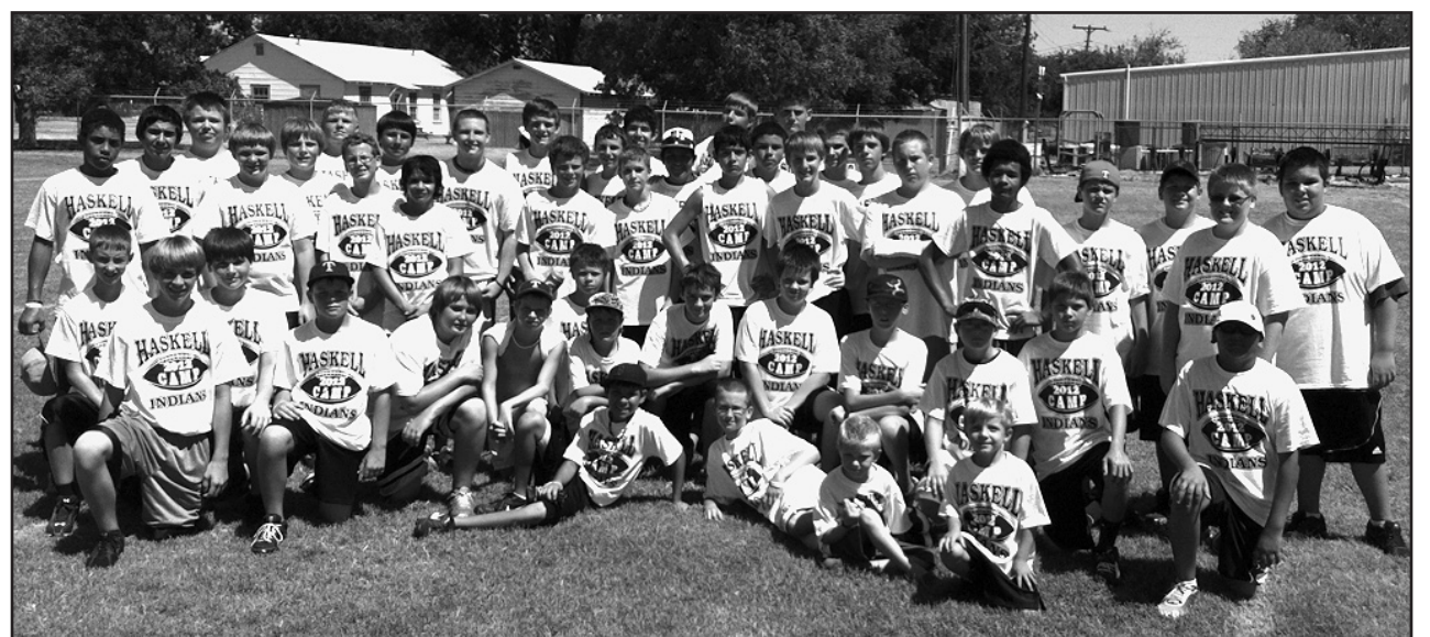
FOOTBALL CAMP —Haskell CISD sponsored a football camp for sixth grade through ninth grade athletes. The camp was held at Indian Stadium July 30-Aug. 2.

For more information on election results go to www.sos.state.tx.us .