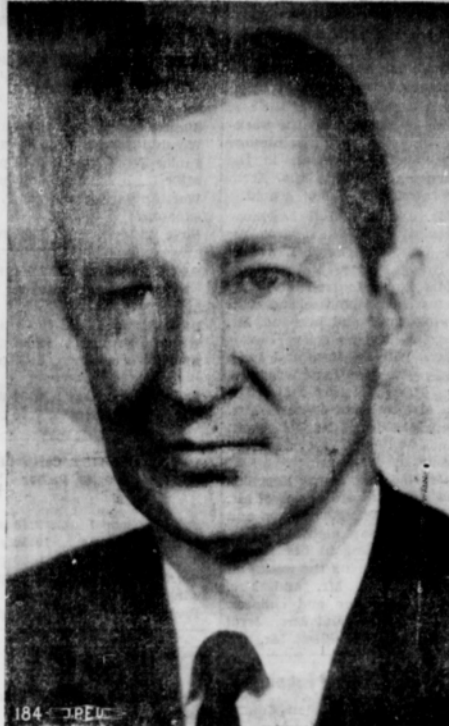
SENATOR RALPH M. HALL ... C of C Dinner Speaker

"The purpose of the V.F.W. shall be fraternal, patriotic, historical, and educational; to preserve and strengthen comradeship among its members; to assist worthy comrades; to perpetuate the memory of our dead and to assist their widows and orphans; to maintain true allegiance to the government of the United States of America, and fidelity to its constitution and laws; to foster true patriotism; to maintain and extend the institution of American Freedom and to preserve and defend the United States from her enemies whomsoever."