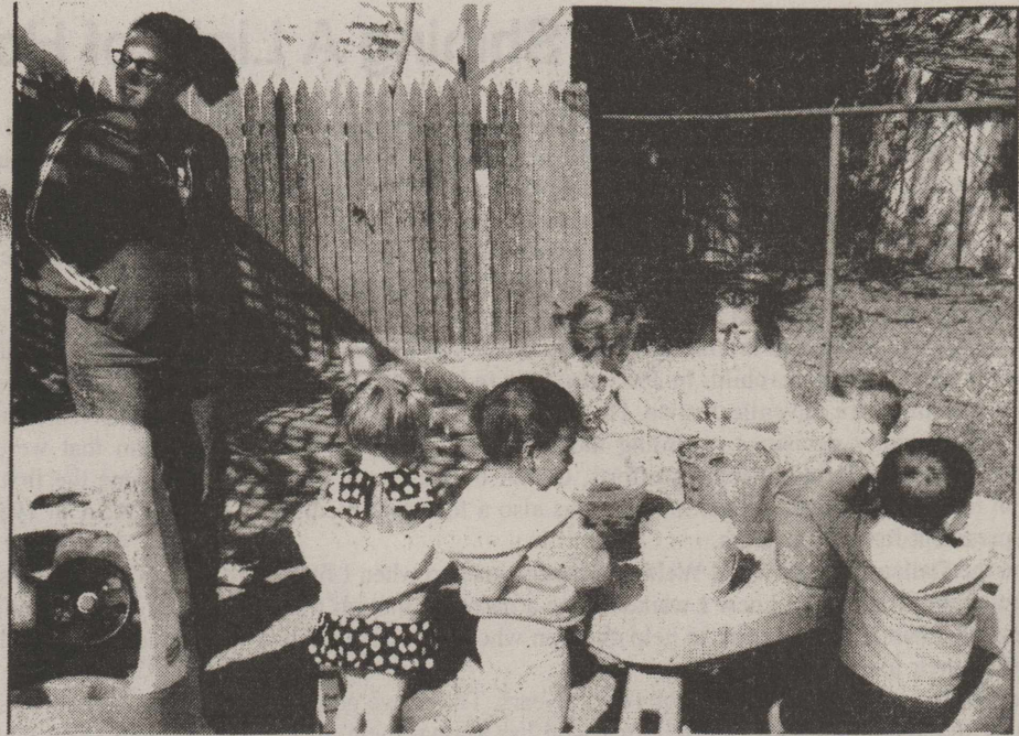
Toddlers at Lollipop Junction are exploring what they found during their Easter egg hunt held Thursday, April 21st

Children at Lollipop Junction (shown at right) are learning how to properly wash their hands to kill germs that may make them sick.