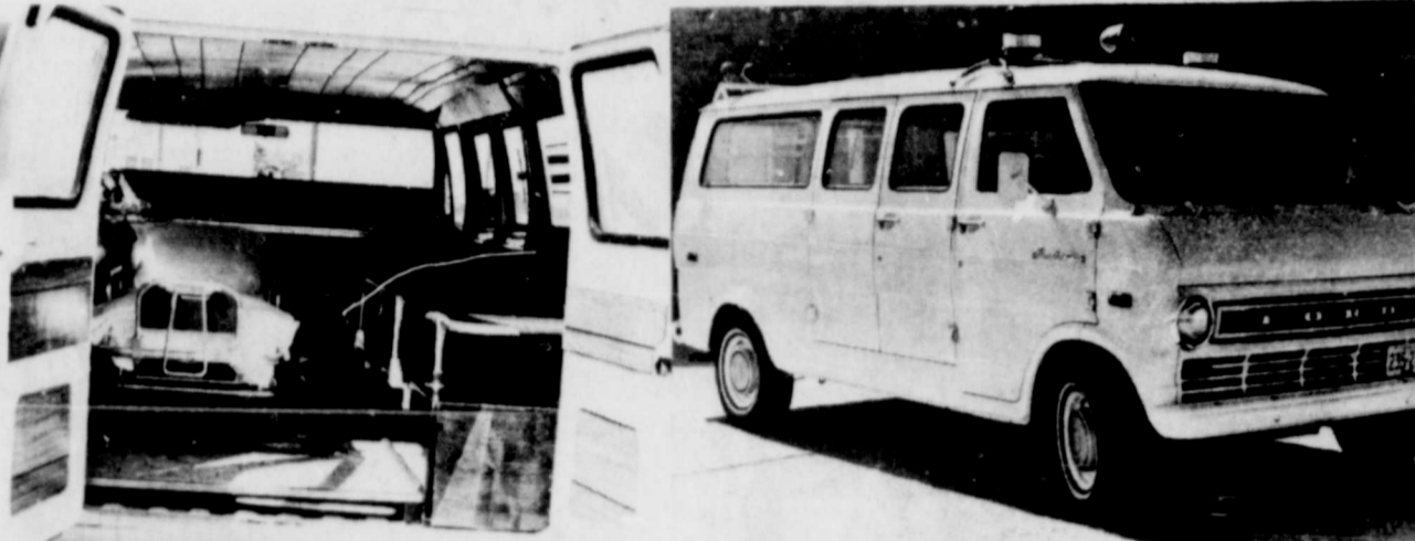
NEW AMBULANCE - The new Martin County Hospital ambulance is ready to roll this week, offering some of the most modern equipment available locally for emergency medical treatment. The new vehicle will be manned by