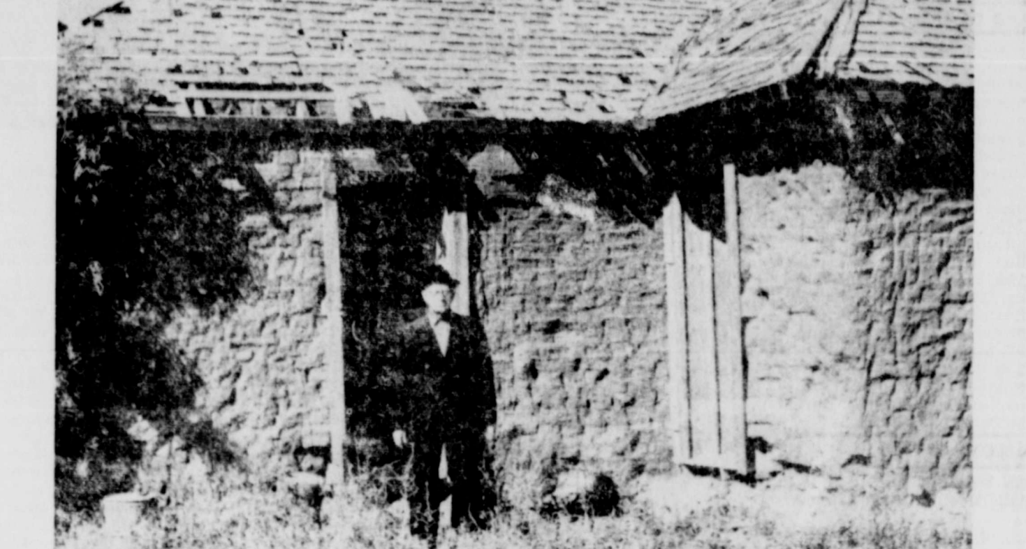
Morgan Hall Stands Beside Stanton's First Hospital