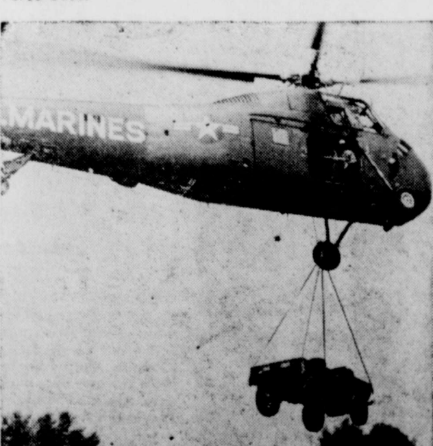
ARMED FORCES DAY-1960. "Mighty Mite" the workhorse of the Marines is given a lift by the Marine Corps helicopter the HUS-1.