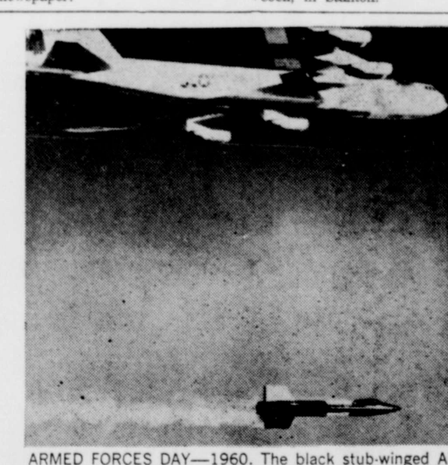
ARMED FORCES DAY-1960. The black stub-winged Air Force X-15 rocket ship, designed for man's first piloted penetration of the fringes of space, drops away from the B-52 mother ship 38,000 feet above Edwards Air