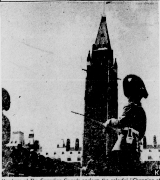
Members of The Canadian Guards perform the colorful "Changing of the Guard" ceremony in front of Canada's Parliament Build Ottawa. Each weekday, this summer, from July 1st to mid-September, this exciting event will be repeated in Canada's Capital. For information on Canadian Events write the Canadian Government Travel Bureau,