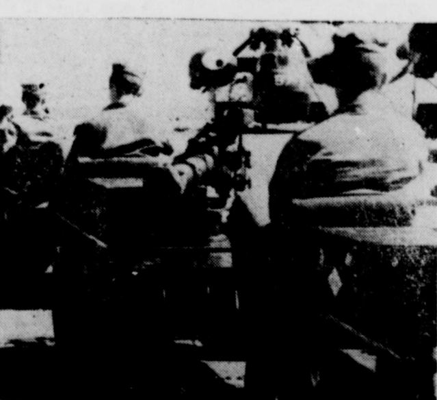
ARMED FORCES DAY-1960. As the assault progresses, mechanical mules (Infantry Weapons Carriers) lining the flight deck of the USS BOXER are loaded aboard Marine Corps helicopters and will follow the troops into the