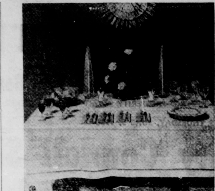
SUMMER SUPPER SETTING—A cool and inviting table setting is created with an airy all-cotton lace tablecloth and icy, lustrous crystal. Cotton lace tablecloths are available in a wide range of colors, including dramatic black. The cloth pictured here is in rose beige by Quaker Lace.