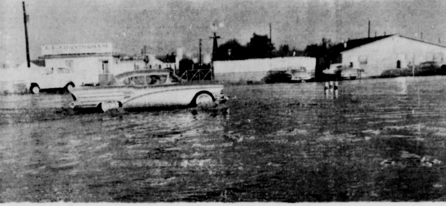
HIGH WATER—Water turned some area highways into lakes in Sunday's storm that brought as much as four inches rainfall to some counties in the Basin. Martin County caught an average of an inch and one-half in the