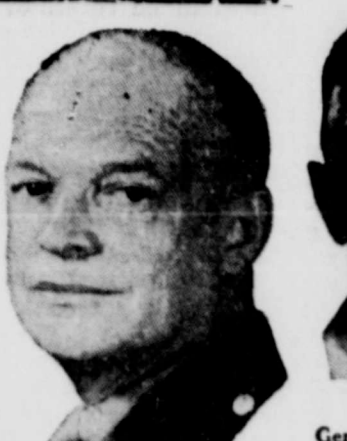
Gen. Dwight D. Eisenhower