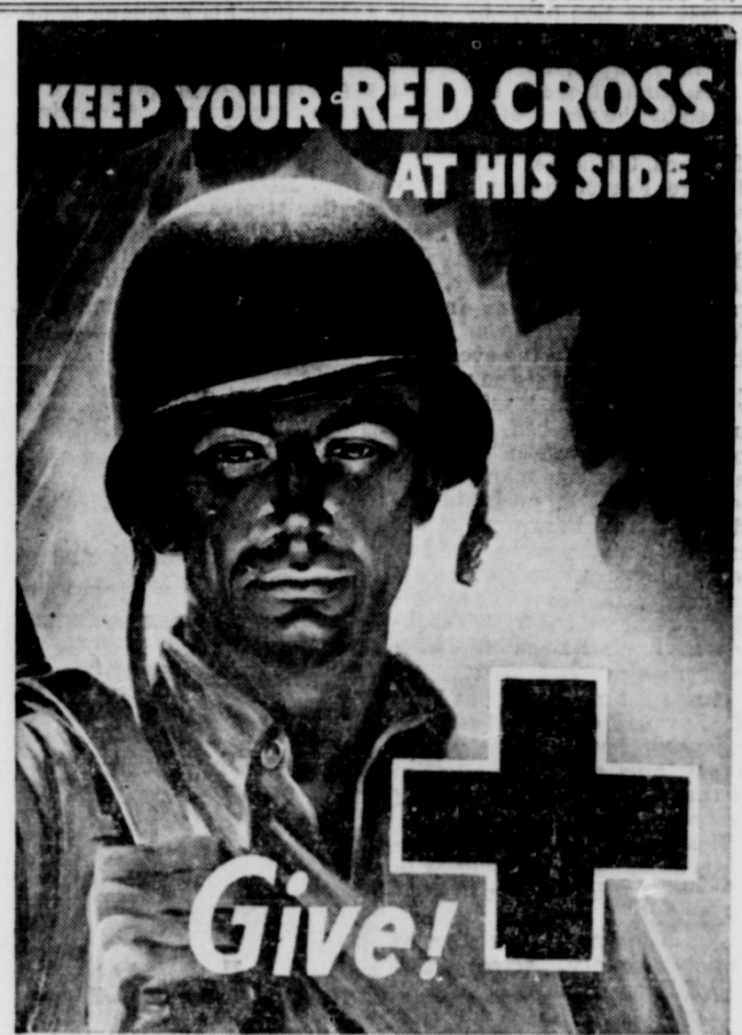
Through the Red Cross the American people serve the men of their Army, Navy, Marine Corps and Coast Guard.