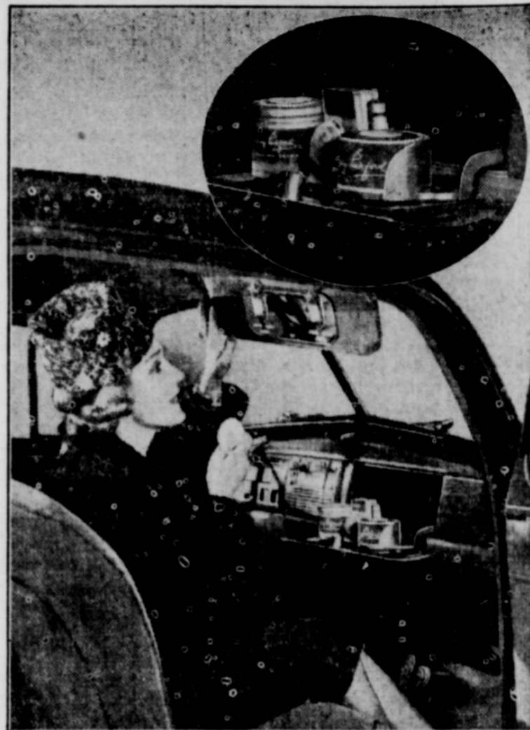
The desire to make a car reflect its owner's individuality is a potent factor in the average motorist's choice of accessory equipment. And it would be hard to find a more thoroughly "personalized" car than this new Chevrolet in which Mary Pickford is shown applying a touch of makeup. As if the handy illuminated vanity mirror were not enough, the car has a special kit of Miss Pickford's own famous beauty aids, now on the market under her name. The container, holding lipstick, rouge, powder and cream, folds neatly up into the glove compartment when not in use. Inset shows close-up of vanity case.