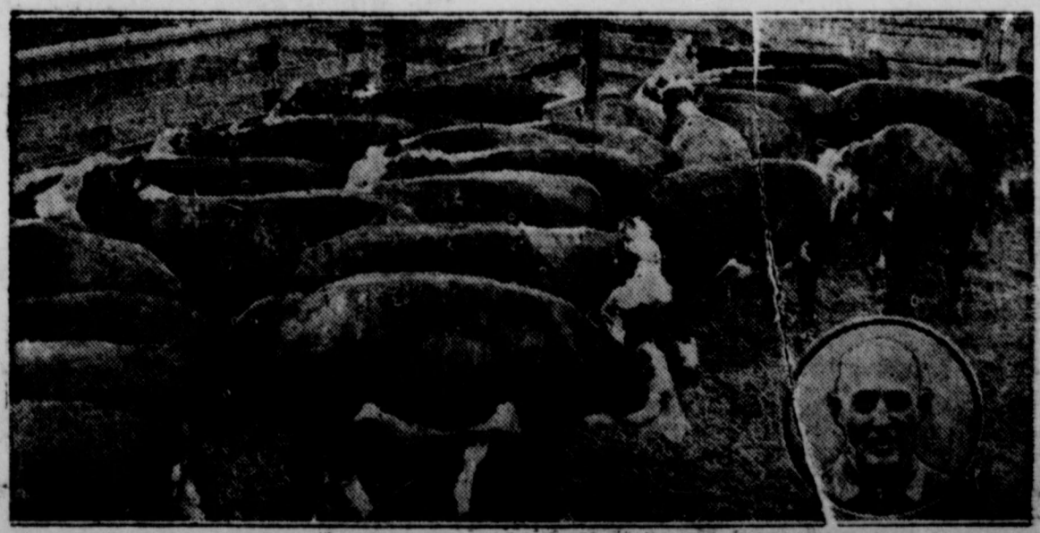
These are the calves, owned by B. I. Hill, at 14 months old weighed an average of 825 pounds, and sold at 11 cents a pound on the Fort Worth Market in 1937.