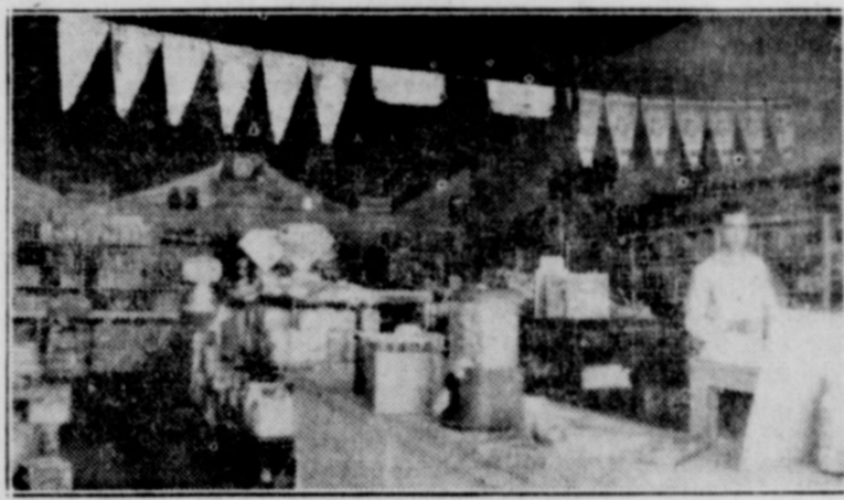
PRESENT LOCATION OF JONES' GROCERY-MARKET