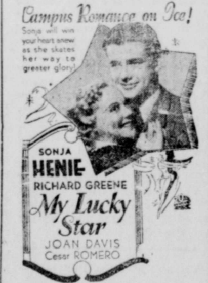
This is Another Movie Quiz Picture

YUCCA Midland Prevue Sat Night Sun., Mon., Tues