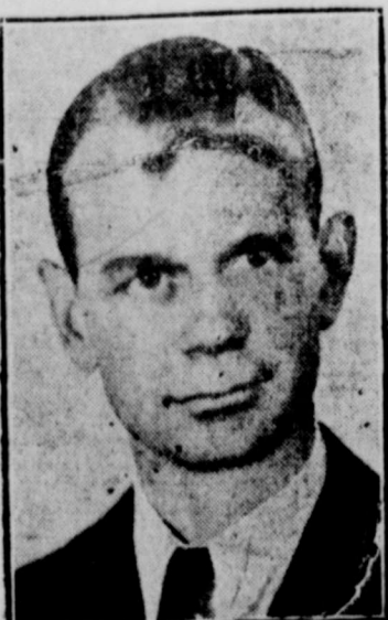
Present County Attorney of Howard County, is a candidate for District Attorney of the 70th Judicial District.