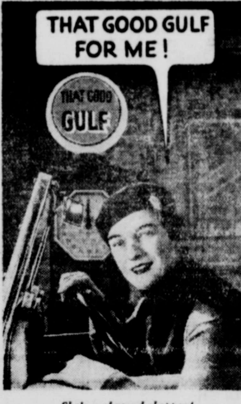
She's a shrewd shopper!