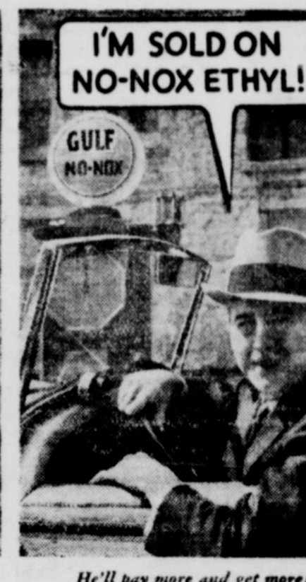
He'll pay more and get more!