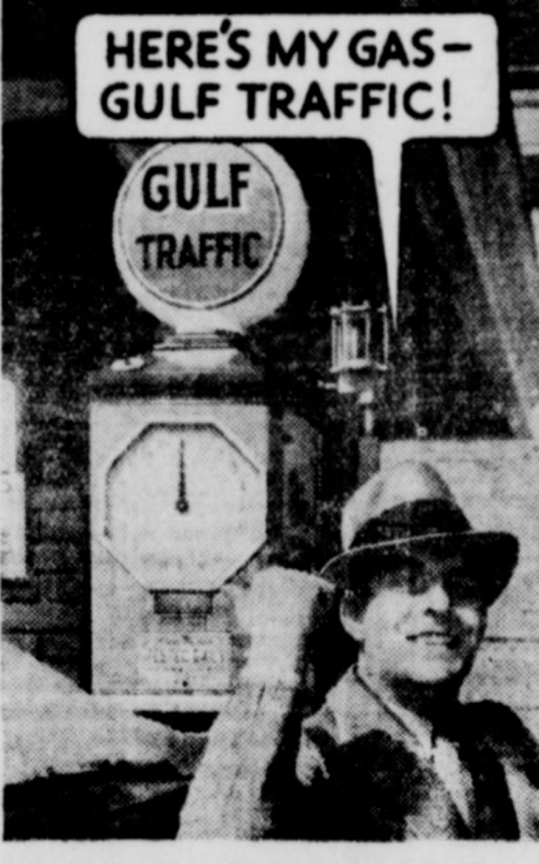
He knows his low-priced gasoline!