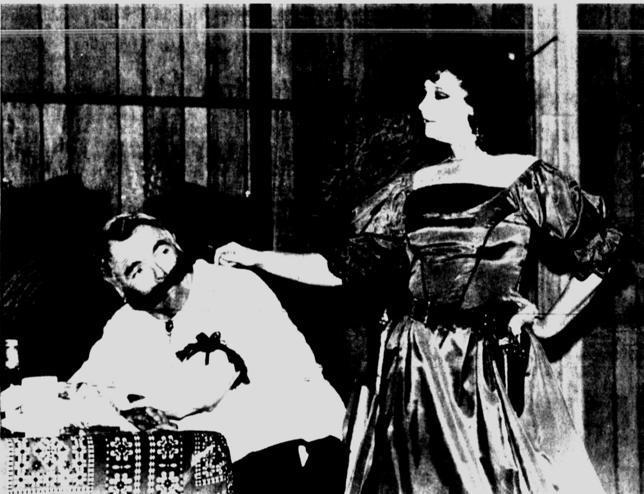
SATURDAY MELODRAMA — "The Saga of Sagebrush Sal" will be presented Saturday in Toile Park Barn as the annual spring fund raiser for the Noah Project here. A Coney Island hotdog meal will be served beginning at 6:30 p.m. before

At 7 p.m. Friday, the Scurry County Museum will host a reception for winners in the wild flower photography competition. Teachers will be honored also who have had 100 percent participation in student art and creative writing projects related to the wild flower observance.