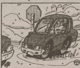
"Feather" the brakes when approaching a stop, especially if the road is slick.

If you follow these tips but still find yourself in a crash, just remember that what you do after an accident can make a big difference in keeping everyone safe and