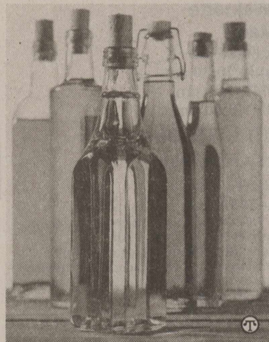
Choose snacks made with a heart-healthy oil such as corn or sunflower oil.

Myth # 3. Baked is better. Baked chips are often recommended because they tend to be lower in fat. So if you are looking to lower fat intake, baked products may be a good option; however, baked doesn't necessarily mean they are significantly lower in calories. At the same time, fried chips can have some nutritional value depending on the oil used. For example, Frito-Lay cooks all its snack chips in sunflower or corn oil,