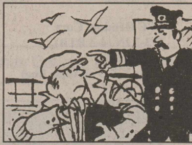
Painter Willem de Kooning left Holland at age 22 and came to America as a stowaway on a cattle boat.

Published in The Stratford Star, Thursday, January 3, 2008 and Thursday, January 10, 2008