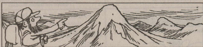
Only one mountain peak on the North American continent is over 20,000 feet. The southern peak of Alaska's Mount McKinley reaches 20,320 feet.