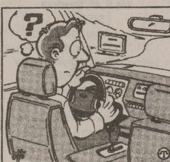
Slow Down: Each 5 mph you drive over 60 mph is like paying an additional 20 cents per gallon of gas.

trips from a cold start can use twice as much fuel as one long multipurpose trip.