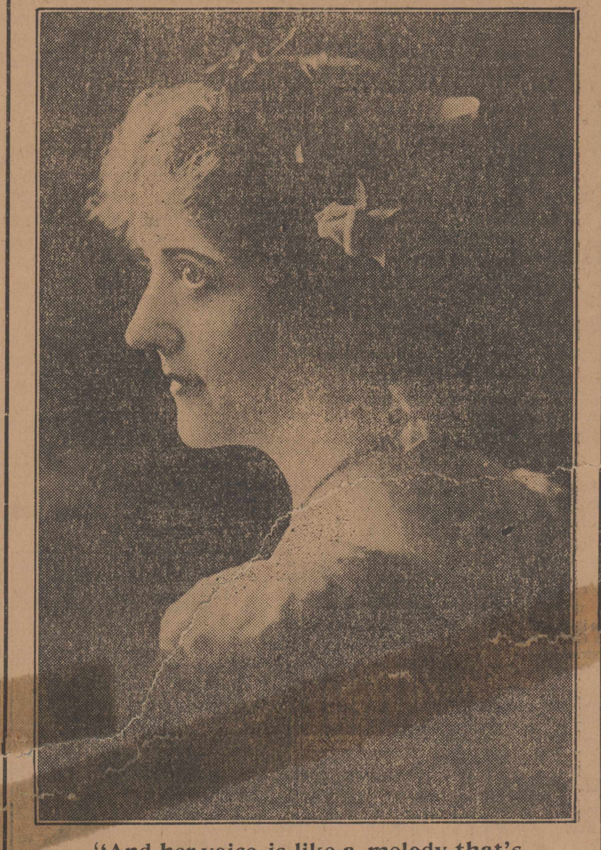
"And her voice is like a melody that's sweetly played in tune."