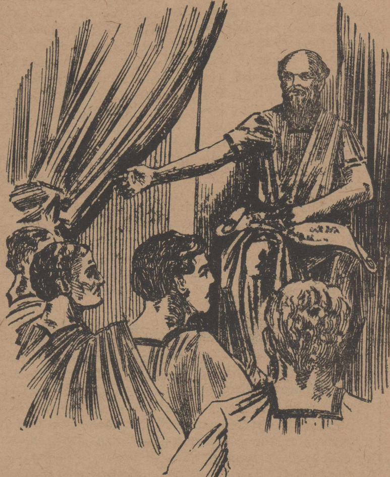
SOCRATES TEACHING WISDOM.

S OCRATES taught the Athenians philosophy and Solon gave Greece her laws and under their inspiring influence civilization bore its noblest fruits. The Greeks owed their advancement to strong leaders who were able to grapple with fundamental thoughts and to a citizenship that drank deeply at the fountain of truth and wisdom. Every age has been indebted for progress to its geniuses who could open the store-house of knowledge and history tell us that nations pine away and die in the arms of ignorance.