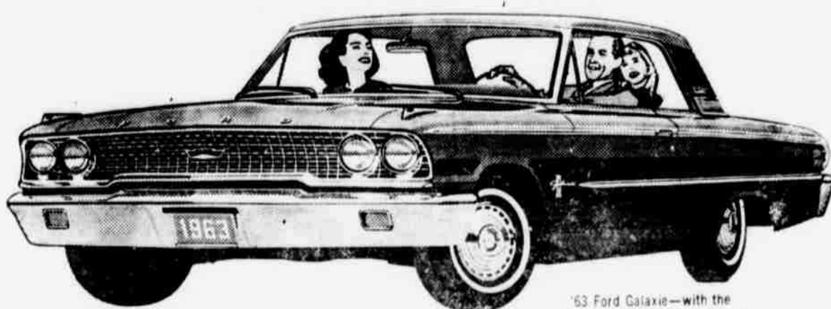
'63 Ford Galaxie—with the look, the power, and the feel of the Thunderbird!

INVITES YOU TO TRY THE '63 FORD GALAXIE'S NEW $10 MILLION RIDE!