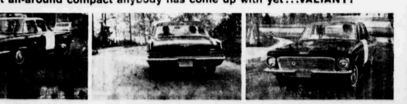
In Dallas, 74% voted Valiant best value. In Syracuse, 78% voted Valiant best value. In Los Angeles, 77% voted Valiant best value.