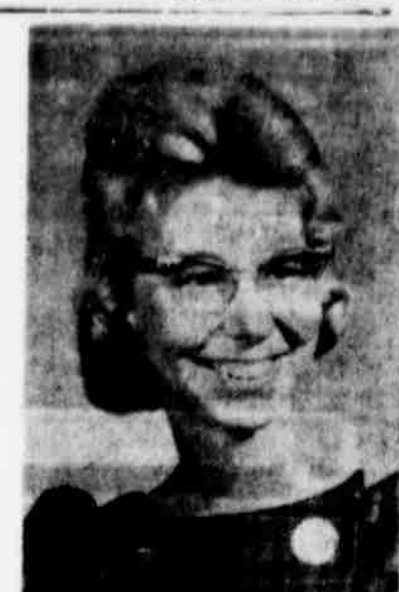
HEAVENLY HOMEMAKER —