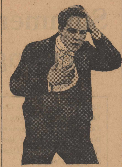
"He is dead!" Blair screamed.

Then she sobbed and tore at her hair, hanging down her shoulders. Her grief and hysteria were not feign-