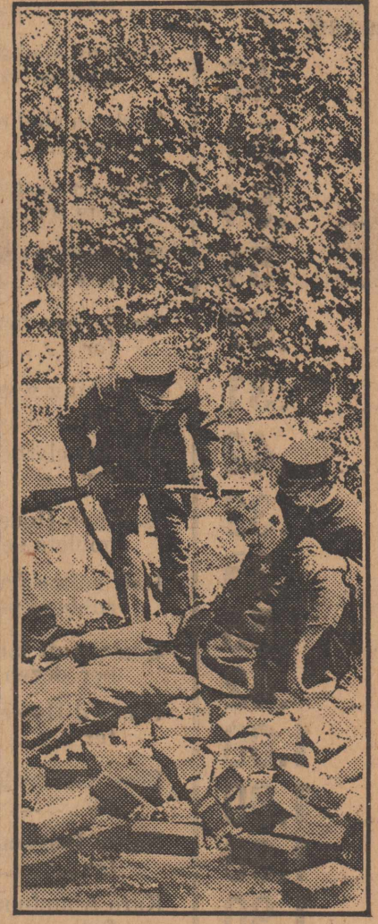
The Bricks Fell Upon the Guards and Overwhelmed Them.