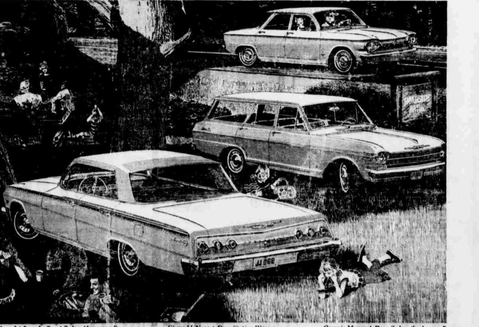
Chevrolet Impala Sport Sedan (foreground) Chevy II Nova 4-Door Station Wagon Corvair Monza 4-Door Sedan (background)

Not just three sizes... but three different kinds of cars... Chevrolet!