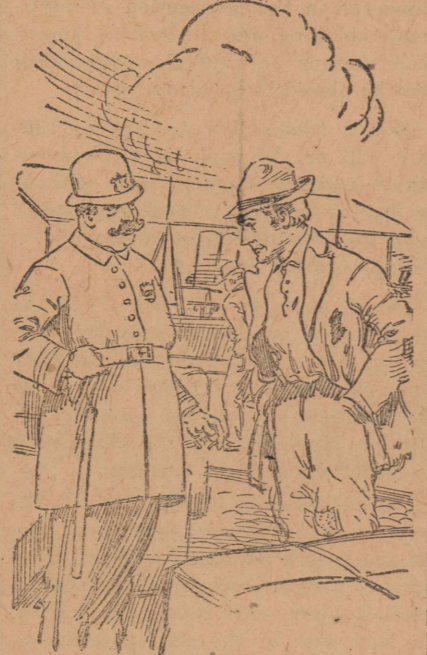
The Whistler Collided With Big Fritz.

IT was with much caution that Whistling Dick slid back the door of the box car, for article 5716, city ordinances, authorized (perhaps unconstitutionally) arrest on suspicion. He saw no change since his last visit to this big almsgiving, long-suffering city of the South, the cold weather paradise of the tramps. Whistling Dick's red head popped suddenly back into the car. A sight too imposing and magnificent for his gaze had been added to the scene. A vast, incomparable policeman rounded a pile of rice sacks and stood within 20 yards of the car. Whistling Dick, professional tramp, possessed a half friendly acquaintance with this officer. They had met sev-