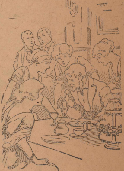
Feasting at the Planter's Table.

Softly as a burglar goes, he clambered out upon the sill, lowered himself until he hung by his hands alone and then dropped safely. No one seemed to be about upon this side of the house. He dodged low and skimmed swiftly across the yard of the low fence. It was an easy matter to vault