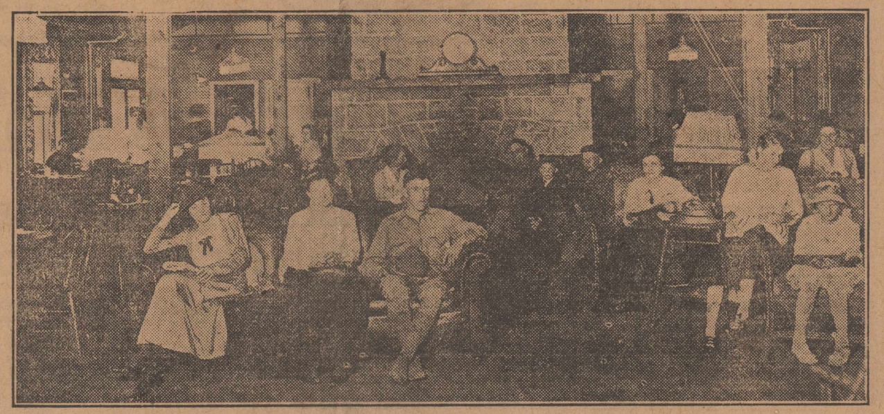
While waiting to go overseas, many Texas men have been quartered at Camp Dix. New Jersey. During the period of their training, some were ill, and relatives from home visited them, obtaining personal and intimate Information as to their condition from the Hostess House of the Young Women's Christian Association