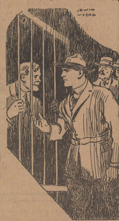
to the End?"

happened since I saw you last! I've residence is unknown, to be and aprested yet."