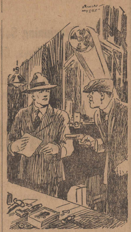
'Hurry Up! Turn Over the Name and Address."

vivin' relatives. Name, please?" "Henry Gramont," was the calm re-